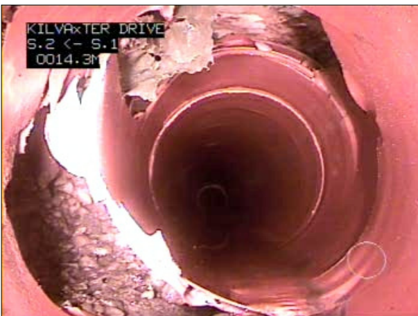
Photo: 20_9a, Tape No.: 001, 00:05:22 14.2m, Hole in sewer from 06 to 09 o'clock