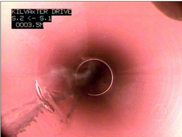
Photo: 17_6a, Tape No.: 001, 00:01:39 3.5m, Hole in sewer from 06 to 07 o'clock